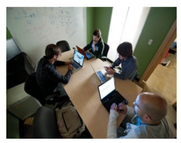
Helping businesses plan for future success.

Strong counties provide resources to assist entrepreneurial activity within the region. MSU's Product Center helps Michigan entrepreneurs and businesses to develop and launch new product and service ideas into the food, agriculture, and bioenergy markets. In Muskegon County 73 client counselling sessions have helped guide multiple clients through business planning to market analysis and research. MSU delivers what entrepreneurs need directly or from our statewide network of university, business and governmental partners.