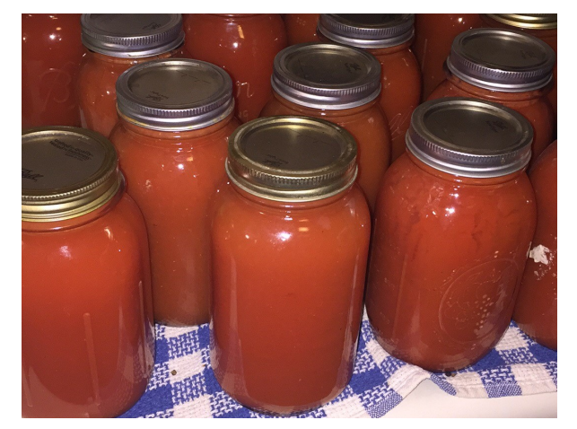
Learning to can using up-to-date, safe methods reduces the risk of food-borne illnesses.

Providing assistance to help residents and businesses keep food safe is a hallmark of cooperative extension services across the country. In Muskegon County, we provided ServSafe education for restaurant staff, classes in home food preservation (canning, freezing and drying), assistance to food pantries, and "Safe Food Healthy Kids" classes for childcare providers.