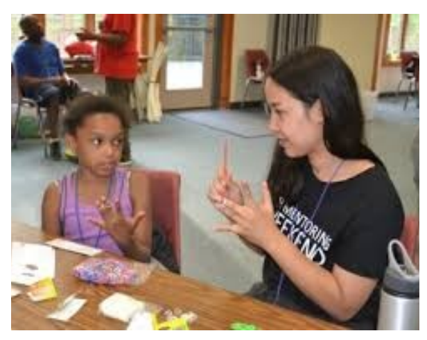
Mentor training being put in to practice.

Homeowners often have insect infestations or plant diseases that they are unfamiliar with and need help addressing. MSU Extension provides soil testing, plant and insect identification, disease identification and treatment, Smart Gardening resources, and a toll-free Lawn and Garden hotline. The Muskegon County MSU Extension office provides assistance to many customers with basic home gardening concerns.