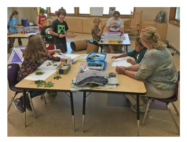
4-H Tech Wizards participants in Muskegon County.